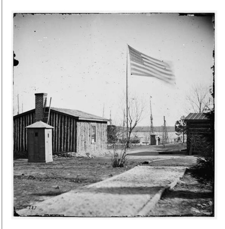
City Point, Virginia, Rear view of U.S. Grant's Headquarters, circa 1864

Whether the Lee/Grant controversy ever is resolved or not, its very existence colors the history of the middle 19th Century in America, and will for the foreseeable future because it suits the sectionalist narrative first made after the war, and it suits the chronic sectionalism that divides American society.