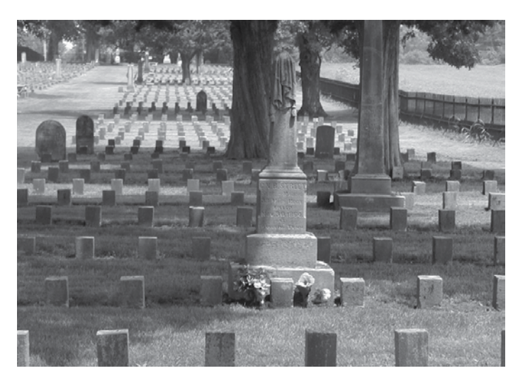
McGavock Confederate Cemetery, Franklin