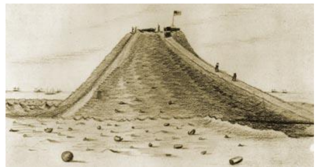
Mound Battery – Fort Fisher from the Official Records